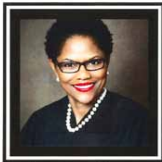
JUDGE PAULA BROWN Fourth Circuit Court of Appeals, New Orleans, LA