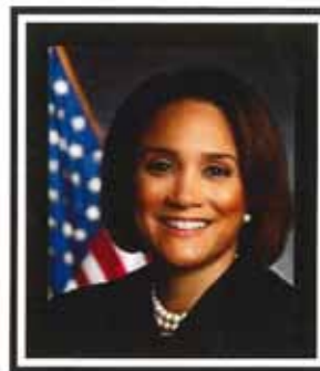
JUDGE REGINA BARTHOLOMEW-WOODS Fourth Circuit Court of Appeals, New Orleans, LA